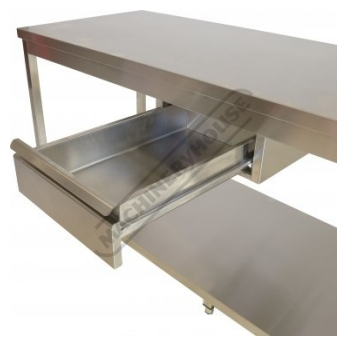
Drawer Fully Open