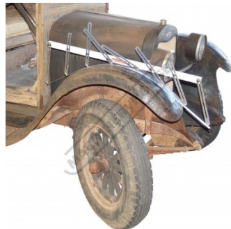
Shown On Truck Single Curve