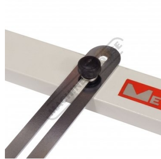
Quick Locking Thumb Screws