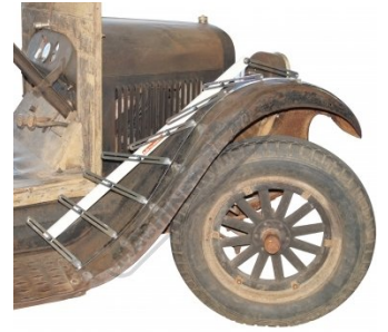
Shown On Truck Fender with 2 Curves