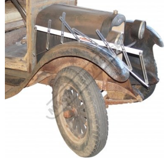
Shown On Truck Single Curve