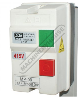
ON OFF Switch