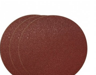
A5403 80G x 380mm (15") Aluminium Oxide Sanding Disc Pack