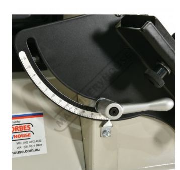
Table Tilt Scale