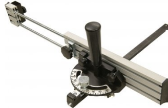
W308 Mitre Gauge & Fence