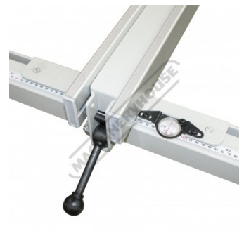
Single Lock Lever on Rip Fence with Magnified Scale