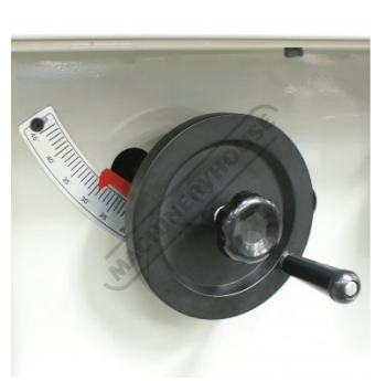
Blade Height Adjustment Handle and Angle Scale