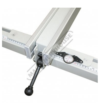
Single Lock Lever on Rip Fence with Magnified Scale