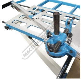
Sliding Table with Mitre Guide and Material Clamp