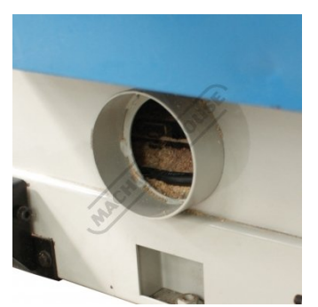
100mm Dust Chute