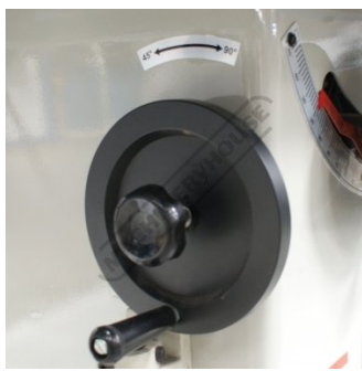
Tilt Arbor to 45 degrees