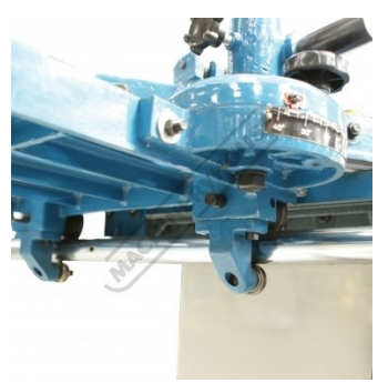
Swivel Wheels on Mobile Base with Leveling Screws Heavy Duty Mitre Guide 60 degrees Heavy Duty Ball Bearing Table Slides