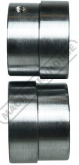
1/16 Inch (1.6mm) Flange Rolls

sales@machineryhouse.com.au www.machineryhouse.com.au