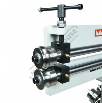
Shown With 1/2" (12.7mm) Beading Rolls