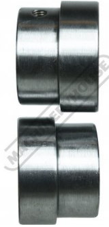
1/8 Inch (3mm) Flange Rolls