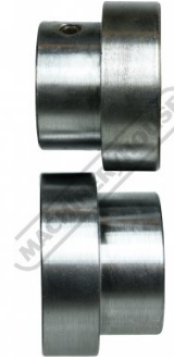
1/4 Inch (6.35mm) Flange Rolls