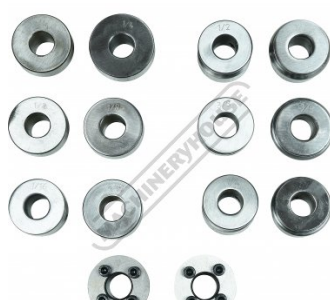
Roll Sets Top View