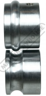
3/8 Inch (9.5mm) Beading Rolls