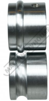
1/4 Inch (6.35mm) Beading Rolls