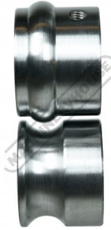
1/2 Inch (12.7mm) Beading Rolls