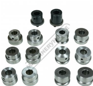
Includes 7 Sets of Rolls