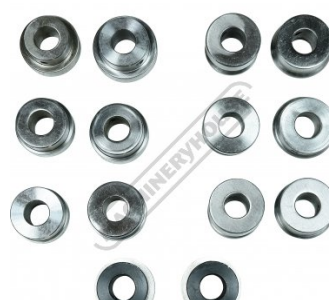
Rolls Sets Rear View