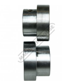
1/4 Inch (6.35mm) Flange Rolls