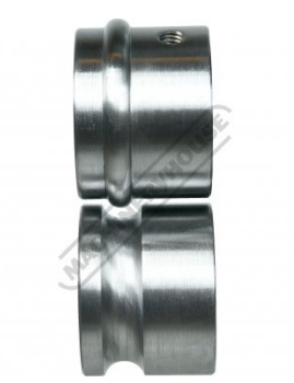
1/4 Inch (6.35mm) Beading Rolls