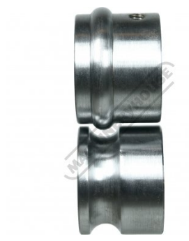
3/8 Inch (9.5mm) Beading Rolls