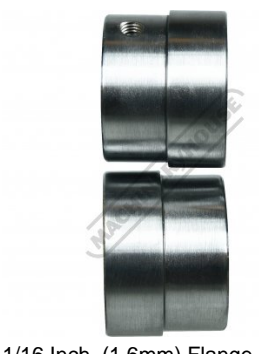
1/16 Inch (1.6mm) Flange Rolls

sales@machineryhouse.com.au www.machineryhouse.com.au