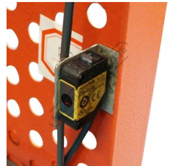
Electric Safety Sensor