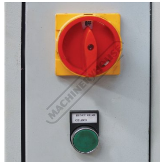
Isolation Switch & Rear Guard Reset Button