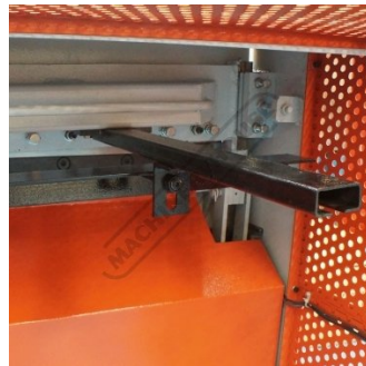
Rear Back Gauge