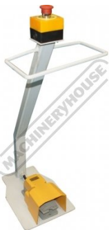
Roving Foot Pedal