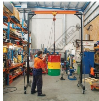
Shown Lifting Oil Drum