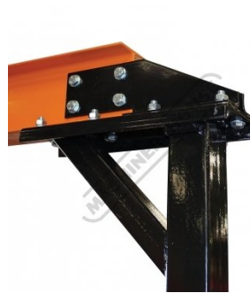
Heavy Duty Beam Support