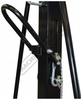
Safety Height Locking Pins