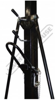
Lever Action Beam Height Adjustment