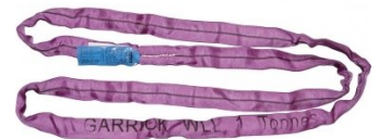
H305 Round Sling