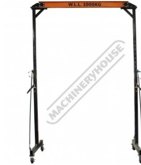
Shown at Full Height