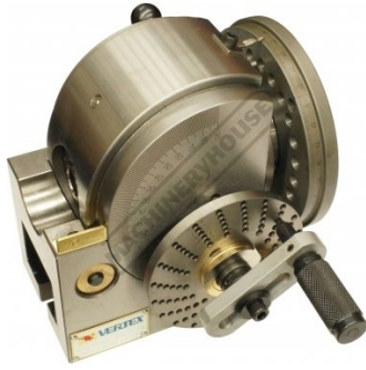
Left Rear View