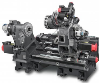
LYNX 2600SY Insert 2