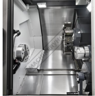
LYNX 2600SY Inside