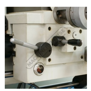
Automatic Feed and Thread Cutting Levers Tailstock