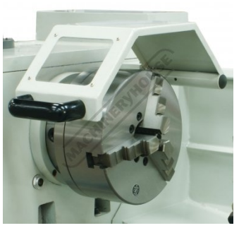
3 Jaw Chuck and Safety Guard