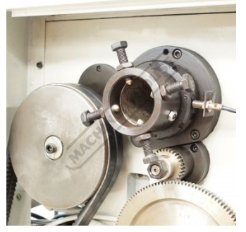
Adjustable Bar Support Mechanism