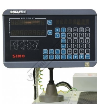
2 Axis Digital Readout