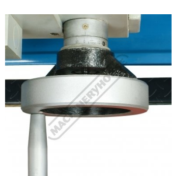
Saddle Feed Handwheel