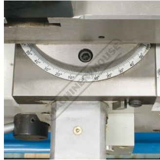
Swivel Compound Table