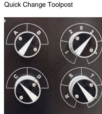
Gearbox Feed Controls