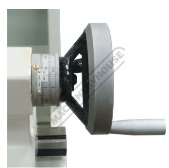
Tail Stock Feed Handwheel