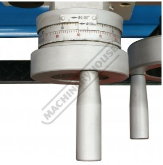
Cross Feed Handwheel