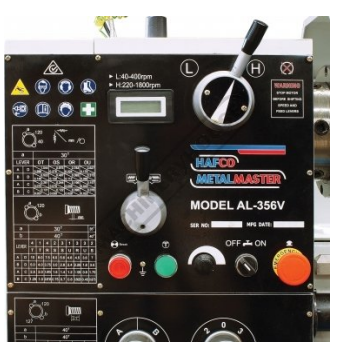
Spindle Speed Controls