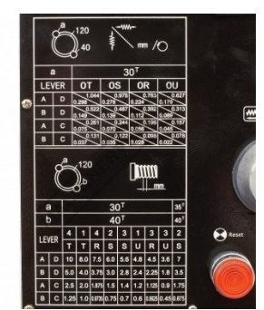
Longitudinal and Cross Feed Chart And Metric Thread Chart