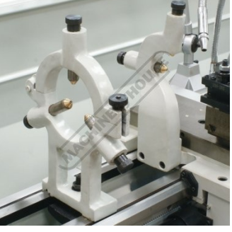
Fixed and Travelling Steadies