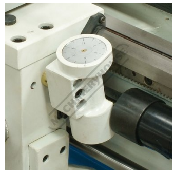
Thread Chasing Dial