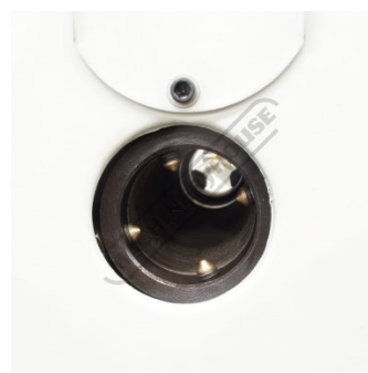
Spindle Bore Bar Support