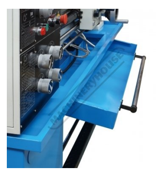
Slide Out Swarf Tray