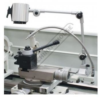
Light and Coolant