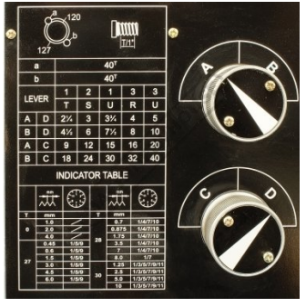
Imperial Thread Chart and Indictor Table Digital Spindle Speed Readout

sales@machineryhouse.com.au www.machineryhouse.com.au