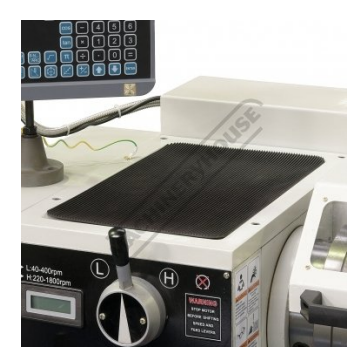
Rubber Matt Protector