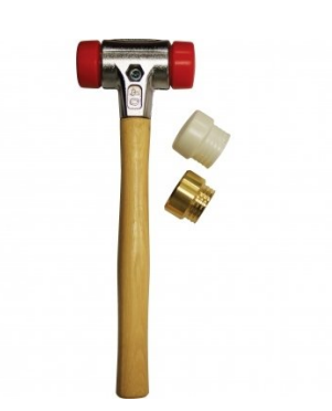
H875 Soft Face Hammer - 5 piece