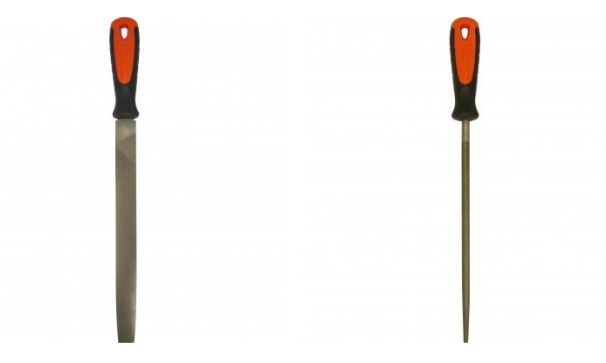
F128 Engineers File, Round - Second Cut