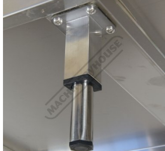
Adjustable Middle Feet