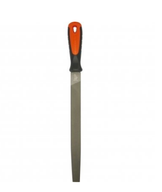
F124 Engineers File, Half Round -Coarse Cut