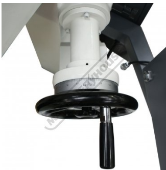
Fine Feed Height Adjustment Dial