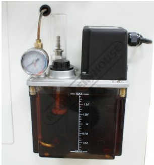
Auto Lubrication Pump