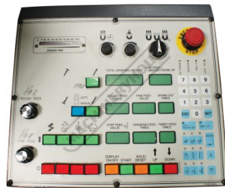
Programmable AD5 Controller