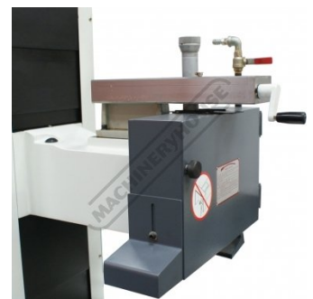
Micro Adjustment Wheel Dresser