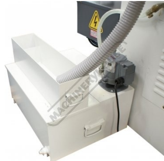
Coolant Pump & Tank