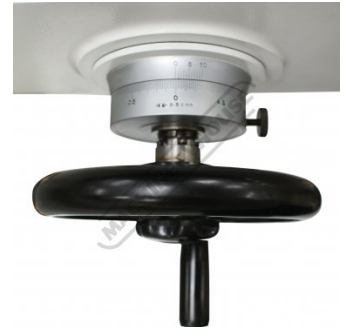
Cross Feed Dial