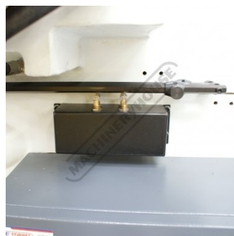
Table Direction Micro Switches