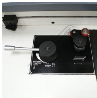
Hydraulic Table Feed Control