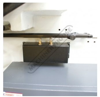
Table Direction Micro Switches