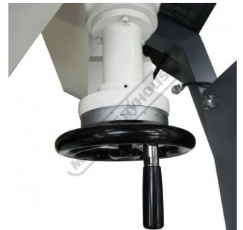
Fine Feed Height Adjustment Dial