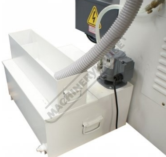
Coolant Pump & Tank