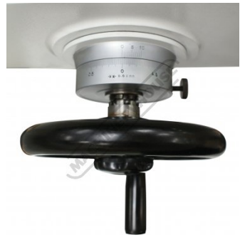
Cross Feed Dial