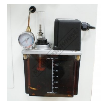
Auto Lubrication Pump