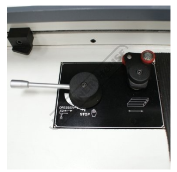
Hydraulic Table Feed Control