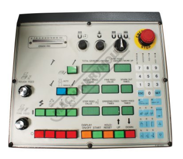
Programmable AD5 Controller