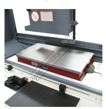
Electro Magnetic Chuck