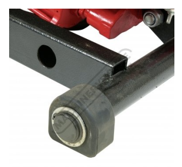
Front Rubber Feet