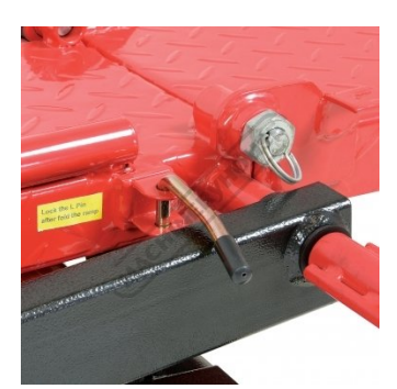
Ramp Lock Pin