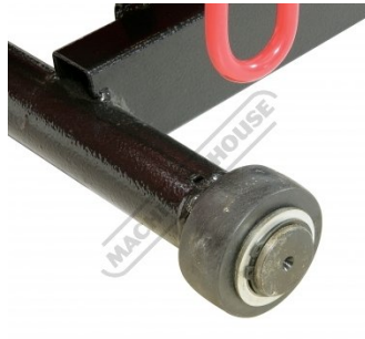
Rear Rubber Wheels