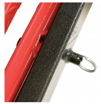
Lock Pin for Safety Support