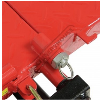
Ramp Release Pins