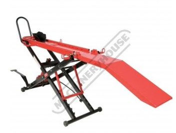
Fully Up Rear View

sales@machineryhouse.com.au www.machineryhouse.com.au