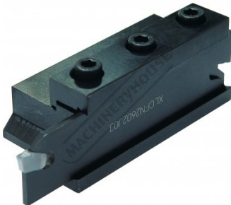
Shown Setup with Optional Blade and Tip