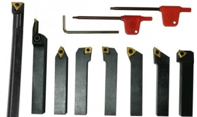
L0099 Lathe Turning Tool Kit - 7 piece Insert Type