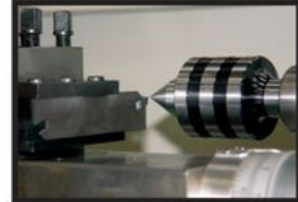
Correct Centre Height

For the tool to cut correctly it needs to be set on centre. This can be best achieved by placing a centre in the tailstock and adjusting the tool height to line up with centre point.