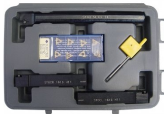
L451 Lathe Turning Tool Kit - 3 piece Insert Type