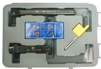
L457 Lathe Threading Tool Kit - Insert Type