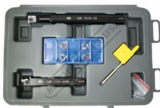
L456 Lathe Threading Tool Kit - Insert Type