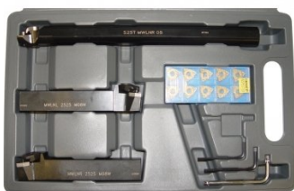
L453 Lathe Turning Tool Kit - 3 piece Insert Type