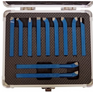
L0085 Carbide Turning Tool Set - 11 piece