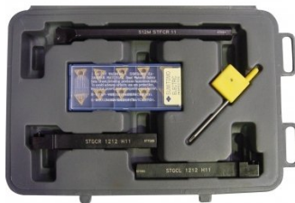
L450 Lathe Turning Tool Kit - 3 piece Insert Type