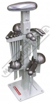
Stand Shown With Optional Dollies