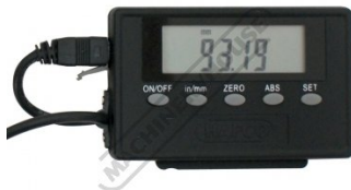
Digital Display Unit