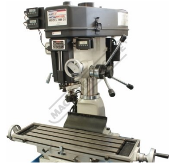
Multiple Axis shown Setup Up on Mill