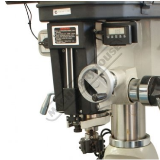
Z Axis Scale