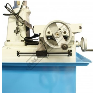
Y Axis Scale