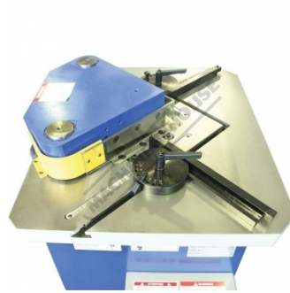
Cast Iron Work Table