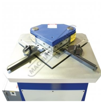
Adjustable Material Guides