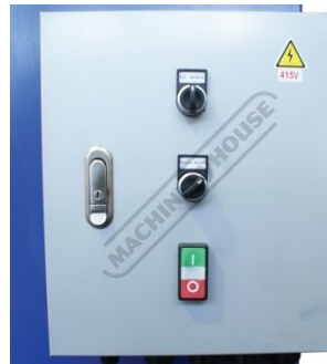
Power Control Panel