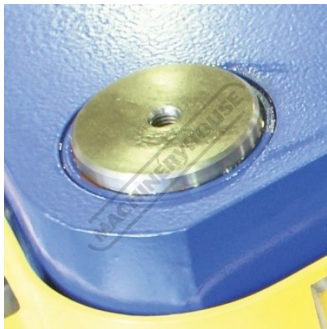
Large Blade Guide Pins