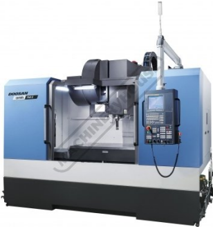
DNM 750 II Side Open