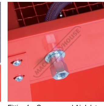
Fitting for Compressed Air Inlet