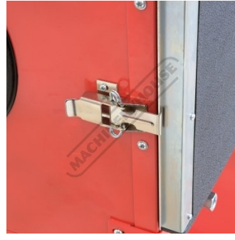
Latch Lock to Side Door