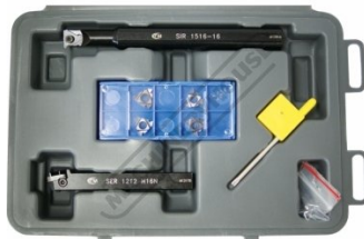
L456 Lathe Threading Tool Kit - Insert Type