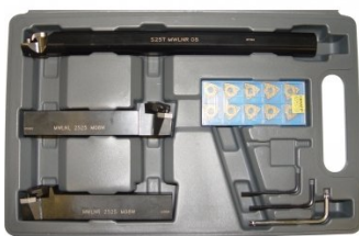
L453 Lathe Turning Tool Kit - 3 piece Insert Type