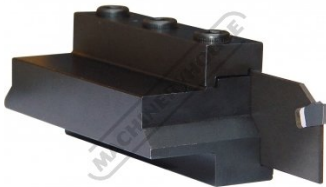
Shown Setup with Optional Blade and Tip