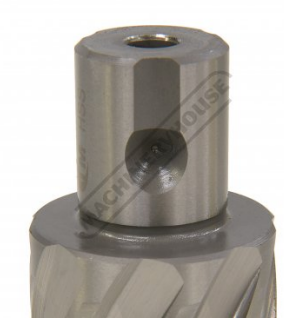
Universal Shank Rear Side