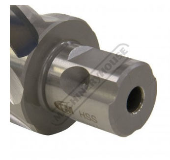
Universal Shank Rear View