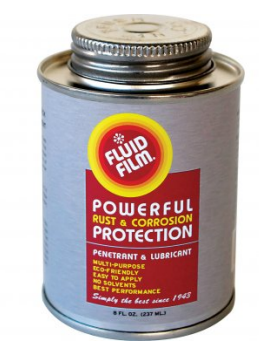
O044 Rust & Corrosion Preventive -Penetrant & Lubrication