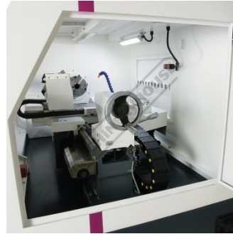
Side View Inside