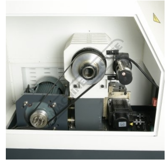
Spindle Drive System