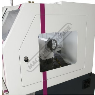
Side Access Door