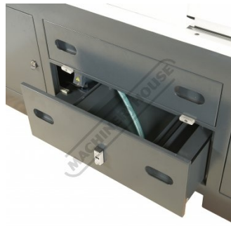
Pull Out Coolant Drawer