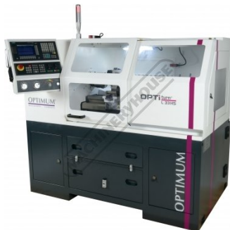
Right View With Swivel Controller