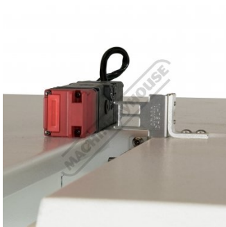
Safety Interlock For Front Sliding Door