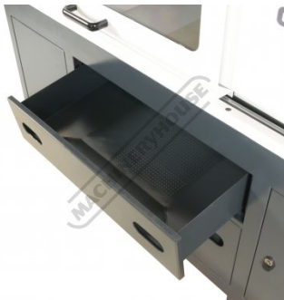
Pull Out Swarf Drawer