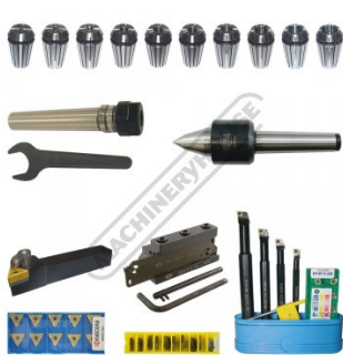
Tool Package Items