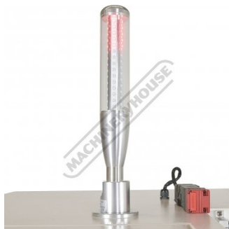
Machine Status Light