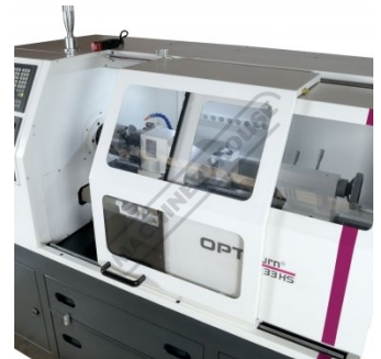
Sliding Front Door