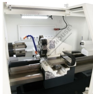
Front View of Chuck and Tool Changer