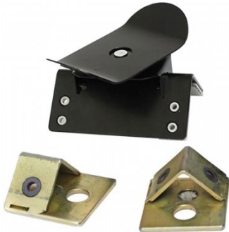
W10350 MIG Hand Rest Glide Kit