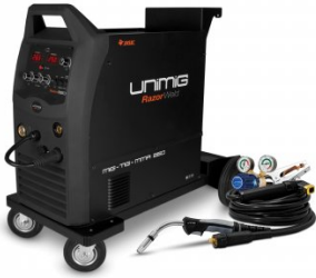
W182 MIG/TIG/STICK WELDER