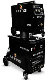
W249 MIG WELDER