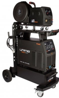
W186 MIG/TIG/STICK WELDER