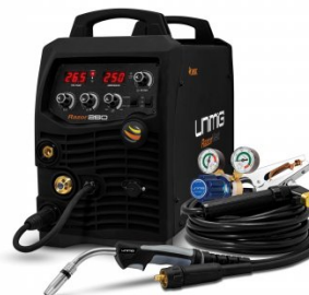
W179 MIG/TIG/STICK WELDER