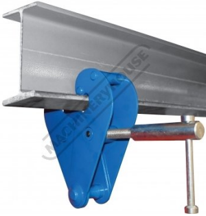
Shown on I Beam