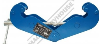
Side View Fully Open