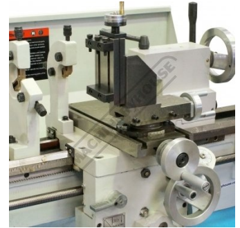
Shown fitted to Lathe