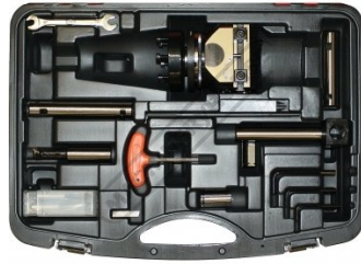
Shown in Case