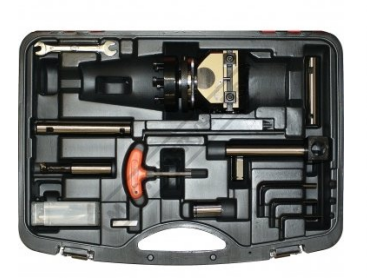
Shown in Case