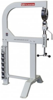
S2257 English Wheel - Heavy Duty