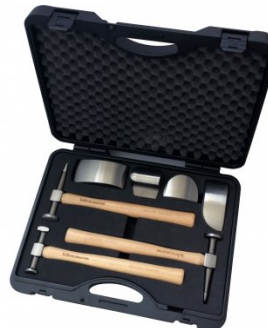
H887 Auto Panel Restoration Kit - Master