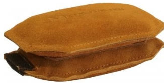
S212 Rectangle Leather Bags - Sand Filled