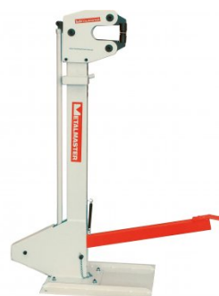
S2266 Foot Operated Shrinker Stretcher - Heavy Duty