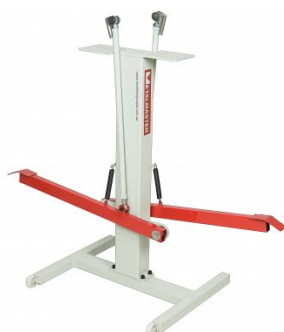
S2264 Foot Operated Shrinker Stretcher - Oval Jaws