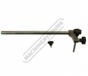
Circle Cutting Attachment