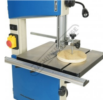
Close Up Shown On BP 255 Wood Bandsaw W950