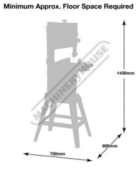
CCA 255 Circle Cutting Attachment Minimum Floor Space Required