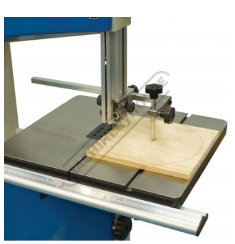
Shown On BP 255 Wood Bandsaw W950 Shown On BP 255 Wood Bandsaw