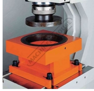
Optional Large Hole Punching