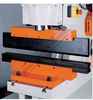
Optional Multi Vee Preesbrake