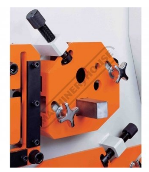
Square Bar Shear