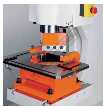
Optional Vee Notcher Punch Side