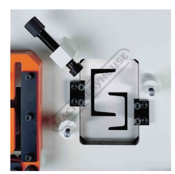
Optional Channel Shear

Keyed Punch Ram For Shaped Tool Alignment Solid Punching Base With T-Slot Grooves Optional Single Vee Pressbrake Attachment