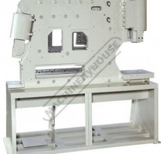
Monoblock Design For Rigid Frame Structure