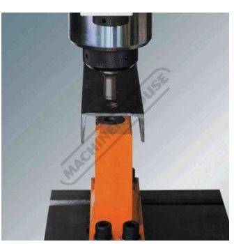
Optional Channel Punching Die Holder