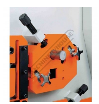
Round Bar Shear

Includes Hydraulic Holddown for Flat Shear Flat Bar Shear