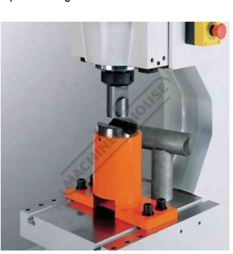
Optional Pipe Notcher