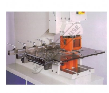
Optional Multi Stop Gauge