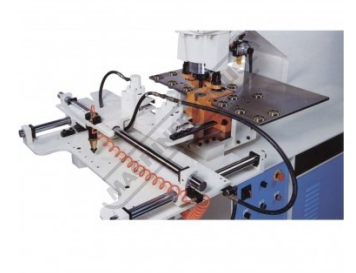
Optional Duplicating Table