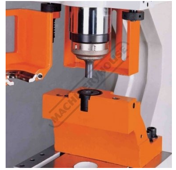
Optional Goose Neck Die Holder

sales@machineryhouse.com.au www.machineryhouse.com.au