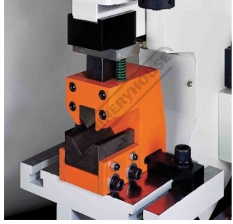
Optional Angle Bending Press