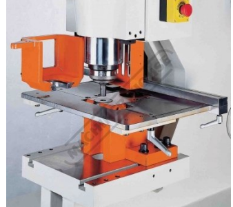
Includes large hole punching up to 50mm Diameter Includes Auto Touch & Cut Length Stop