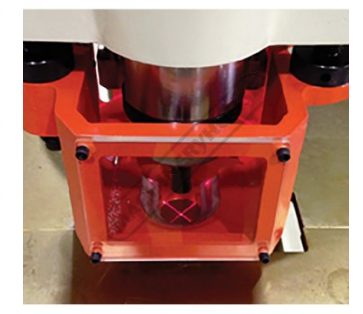
LG-PS - Laser Guide System