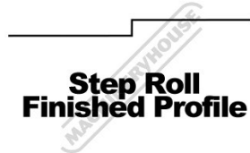
Step Roll Finished Profile