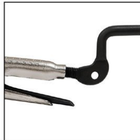
Unique crank handle for fast, easy jaw opening and pressure adjustment.

Crank up, or lessen the torque by inserting a screwdriver.