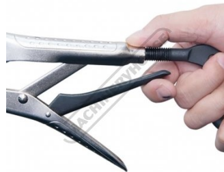
Quick release trigger