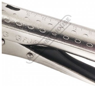
Non Slip grip marks on top and bottom jaws for positive gripping