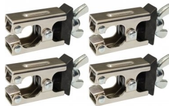
W112 Micro Welding Steel Clamp Set