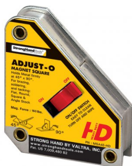
W1006 Adjust-O Magnet Square - Heavy Duty