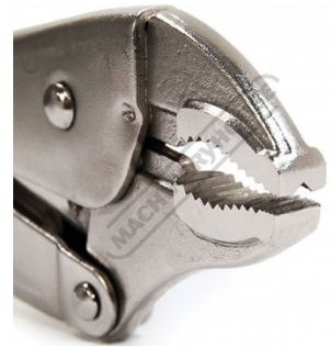
V Groove on top Jaw