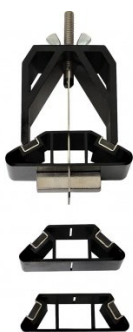
W114 3 Angles Welding Aluminium Clamp Set