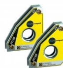
W1009 Mini Magnet Squares - (2-Pack)