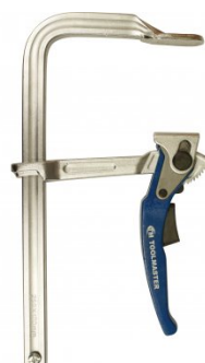
C0012 Ratchet F Clamp