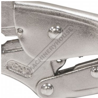
Cr V Brazed Jaw for durability