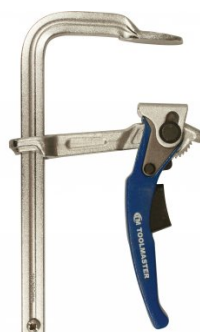
C0010 Ratchet F Clamp