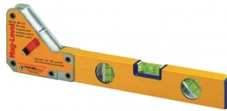
W1020 Magnetic Level