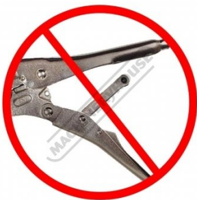
Secure Adjustment Bar minimizes bar pop outs