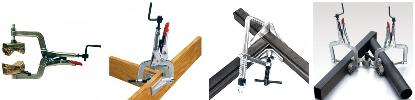
W1012 Adjustable Corner Clamping Plier Set