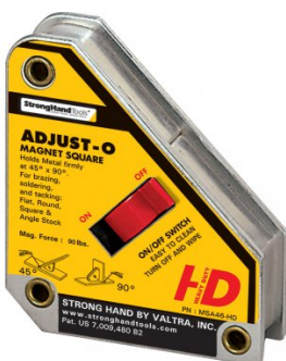
W1007 Adjust-O Magnet Square - Heavy Duty