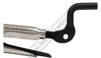
Unique crank handle for fast easy jaw opening and pressure adjustment