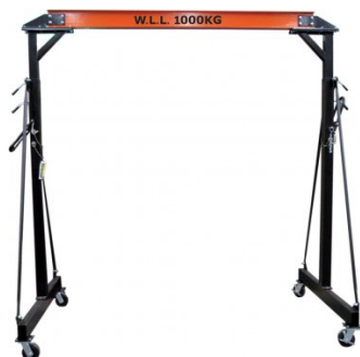
K088 Mobile Girder Rail Gantry Package Deal