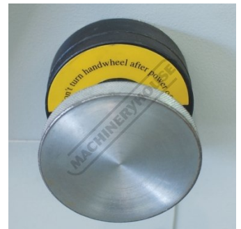
Fine Adjustment Dial for Backgauge