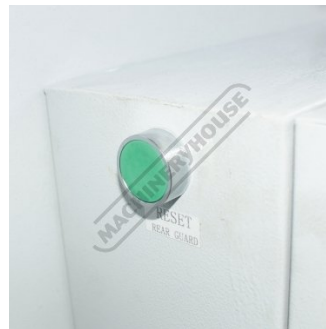
Rear Guard Reset Button