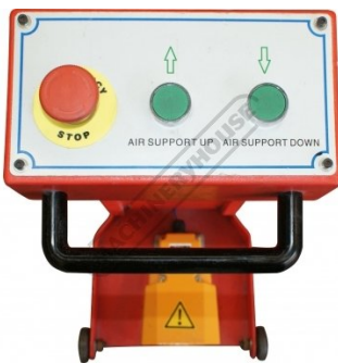
Pneumatic Sheet Support and Emergency Stop on Mobile Foot Control