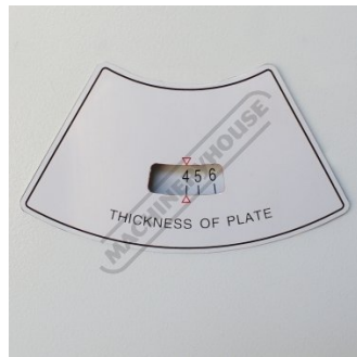
Thickness of Plate Indicator