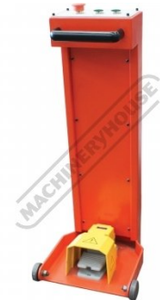
Mobile Foot Control