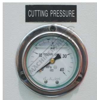
Cutting Pressure Gauge