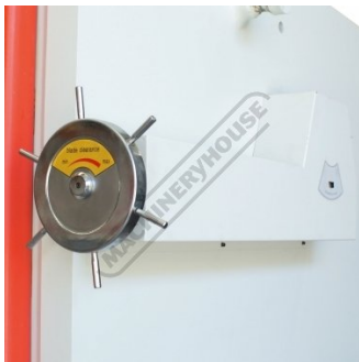
Blade Clearance Adjustment Handle