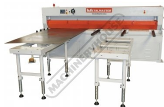
Shown with Optional Ball Transfer Tables - Order Code (L840)