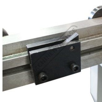
Adjustable Flip Over Stops