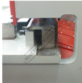
Open Throat for Slitting