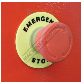
Emergency Stop Switch