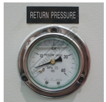
Return Pressure Gauge