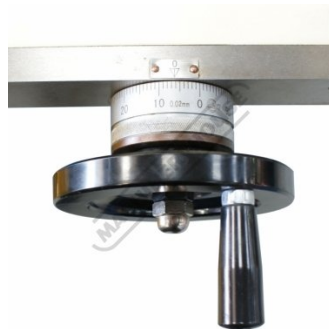
Cross Feed Handle