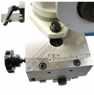
Table Angle Adjustment