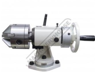
Drill Grinding Attachment