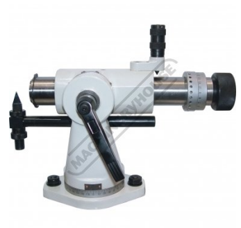
End Mill Attachment