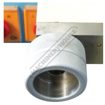
Longitudinal Feed Dial