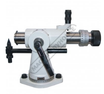
End Mill Attachment