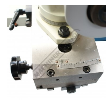
Table Angle Adjustment