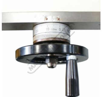
Cross Feed Handle