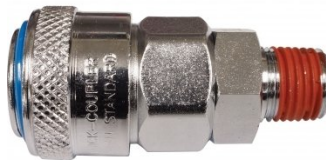
F945 High-Flow One Touch System Air Fittings