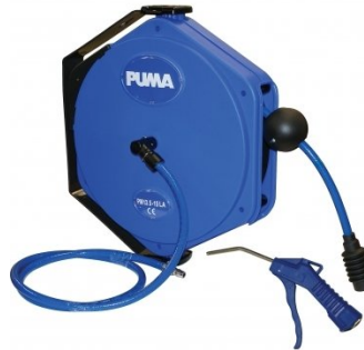
H040 Industrial Retractable Air Hose Reel