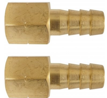
F811 Air Fittings