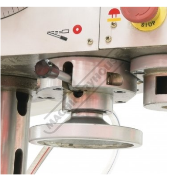
Fine Feed Quill Hand Wheel