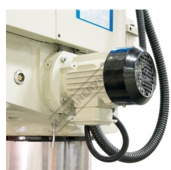
Hydraulic Arm and Head Clamp