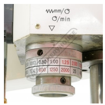
Speed and Feed Selecting Dial