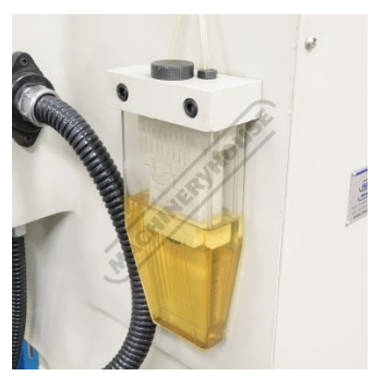
Auto Oil Lubrication For Column