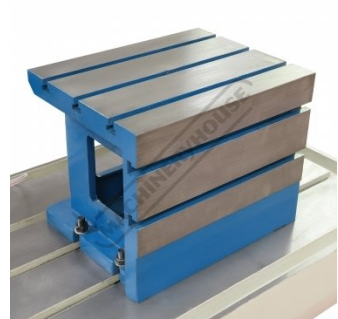
Box Table with T Slots