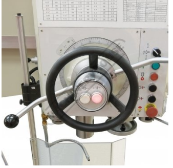
Quill Feed Handle