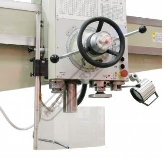
Safety Chuck Guard and Coolant Hose