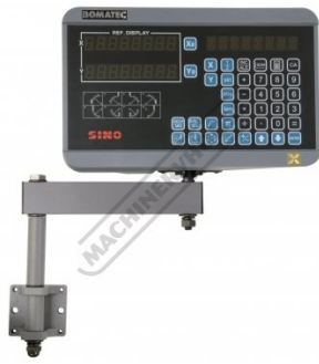
Shown Mounted to Optional DRO Front View