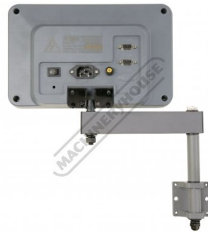
Shown Mounted to Optional DRO Rear View