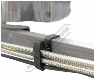
Wire Clips Action Shot