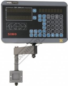
Shown Mounted to Optional DRO