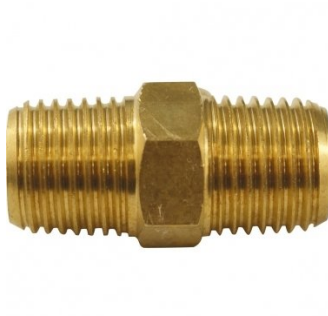
F860 Air Fittings