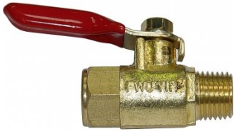
F930 Air Fittings