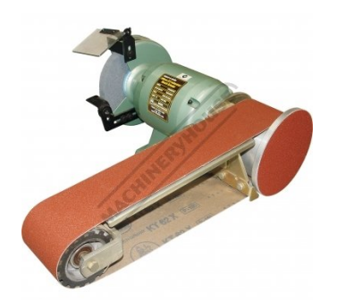
Shown Fitted to a Optional Bench Grinder