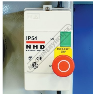
Magnetic Safety Switch