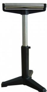
W3434 Roller Stand