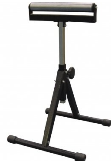
W343A Roller Stand