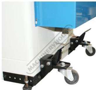
Swivel Wheels on Mobile Base with Leveling Screws