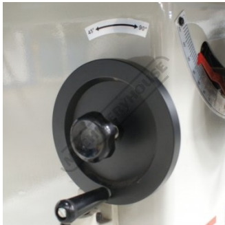
Tilt Arbor to 45 degrees