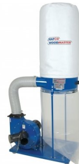
W394 Dust Collector