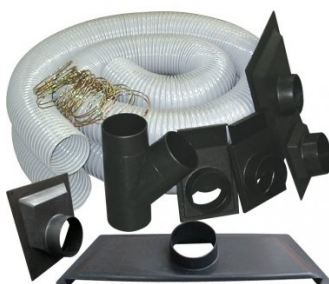
W344 Wood Dust Accessory Kit