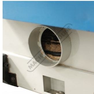
100mm Dust Chute