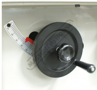
Blade Height Adjustment Handle & Angle Scale