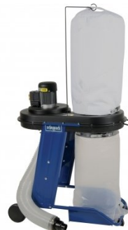
W886 Dust Collector