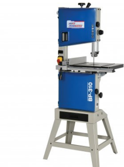
W952 Wood Band Saw