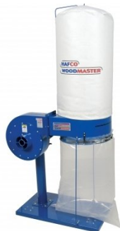
W332 Dust Collector