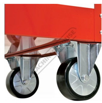
2 x Fixed Wheels