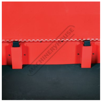
Drawer Locking System