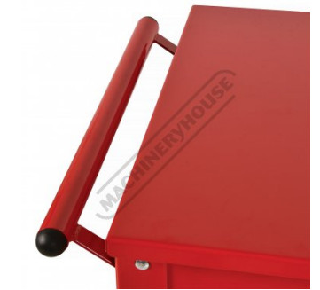
Side Push Handle