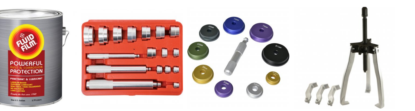
P005 Ratcheting Gear Puller Set

P031 Bearing Race & Seal Driver Set - 10 piece