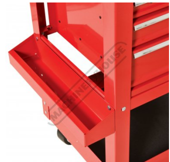
Side Storage Tray