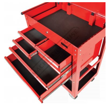
Drawers Include Protective Liners Reinforced Corners