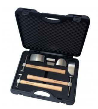
H886 Auto Panel Restoration Kit -Professional