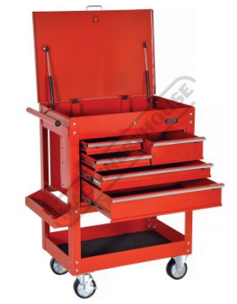
Lid & Drawers Open