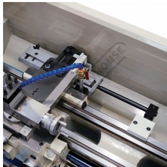
Shown Mounted to a Lathe