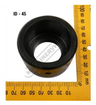
PP0016 DIE RING SPACER